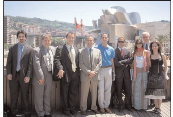
Wheeling Jesuit University's Office of Global Outreach meeting with Deusto University, and GAIA in Bilbao, Spain 2009.