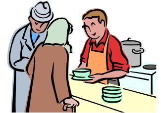
Arrupe Scholars are hard at work in places like Catholic Neighborhood Center in downtown Wheeling.

For more information on the Arrupe Scholarship program or for information on service projects contact the Service for Social Action Center—x8728.