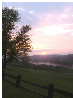
Scenic West Virginia View—Shot taken from Oglebay Hill.